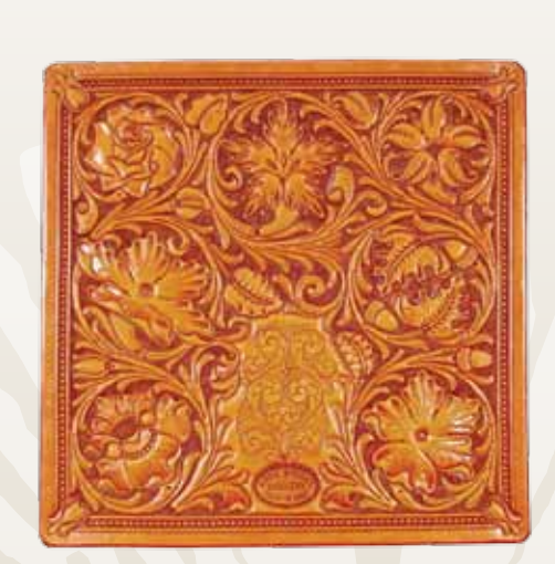
Western saddle sample, 1999 Eddie Brooks, Elko Leather 12" x 12" x ½"