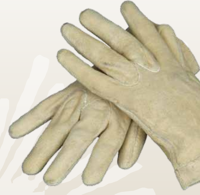
Buckskin Gloves (Paiute-Shoshone), c. 1996 Edward McDade, Elko Untanned buckskin 4 ½" x 9 ½" x 2" each