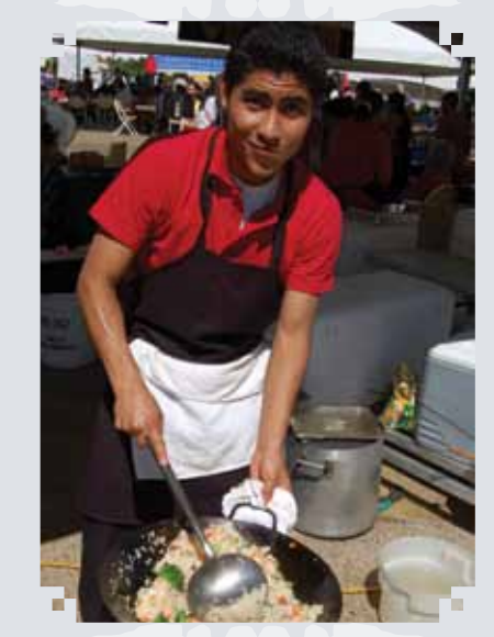
Stir frying rice and vegetables