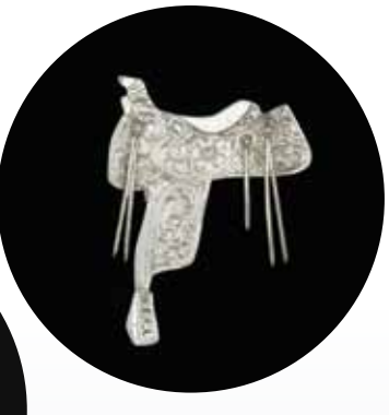
Saddle, 2003 Virginia McCuin, Silver Springs Engraved sterling silver Small flat piece (approx. 2" x 3") Governor's Arts Award 2004