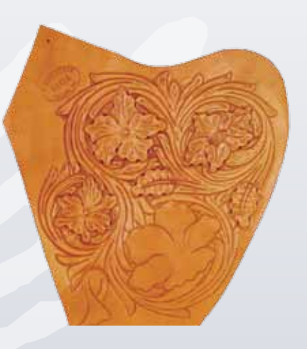
Leather work sample – Western style, 2009 Fred Buckmaster, Fallon Leather 12" x 12" x ¼"