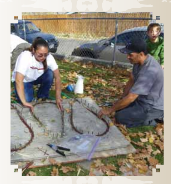
Bending willow for cradleboards

Most masters discover apprentices within their own folk communities. Sometimes the relationship crosses geographic boundaries. Some masters take on apprentices from other ethnic or occupational communities if they have the interest and ability to carry on a tradition in new ways. A folk arts apprenticeship ideally results in a continuing relationship between the master and the apprentice, and between the artists and their community or communities. Some apprentices from the early days of the program have become master artists in their own right and are now passing on skills and knowledge to a third or even fourth generation.