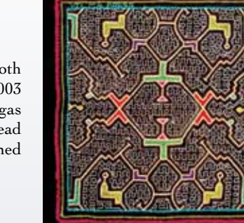
Embroidered cloth (Peruvian-Shipibo), 2003 Vilma Parra, Las Vegas Black cloth, embroidery thread 27 1/2" x 28 1/4" x 1"; framed

Ebru (Turkish water marbling), 2012 Hasna Akbas, Reno Paints on paper 17 1/4" x 20 3/4" x 1"; framed